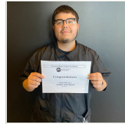
Barber Classroom April Student of the Month