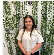
Esthetics Classroom April Student of the Month