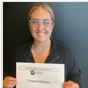
Cosmetology Classroom April Student of the Month