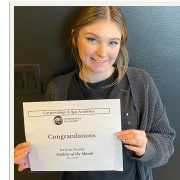
Esthetics Classroom April Student of the Month