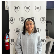
Cosmetology Clinic April Student of the Month