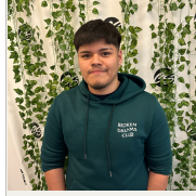
Barber Classroom April Student of the Month