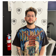
Barber Classroom April Student of the Month