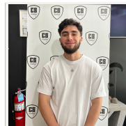
Barber Clinic April Student of the Month