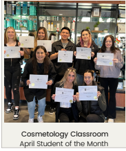
Cosmetology Classroom April Student of the Month