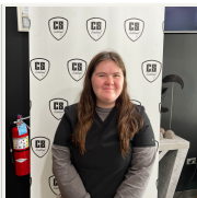
Cosmetology Classroom April Student of the Month