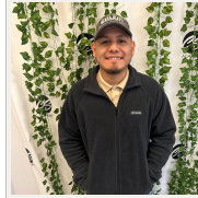
Barber Clinic April Student of the Month