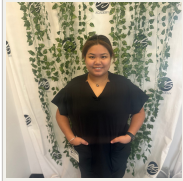
Cosmetology Classroom April Student of the Month