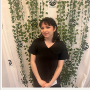
Cosmetology Clinic April Student of the Month